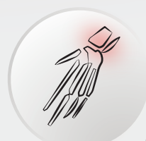
STRAIN AND SPRAIN