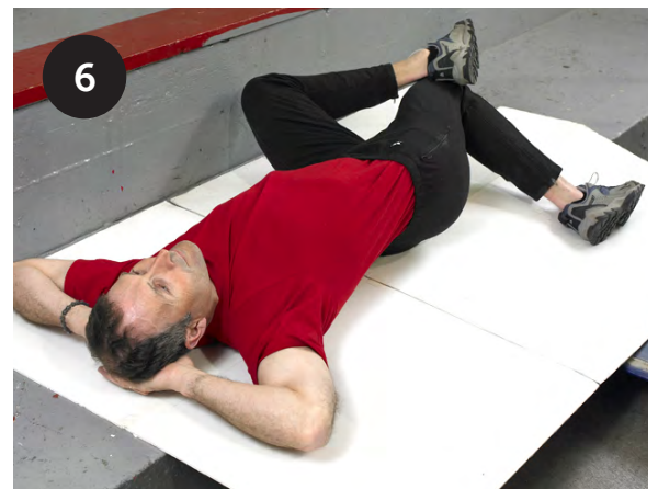
Feel the stretch in the hip!

Lay on your back with your knees bent and feet flat apart on the floor slightly more than shoulder width apart. Lower your right knee to the floor and place your left ankle on top of it pushing the knee towards the ground. Keep your hips on the floor. Hold the stretch for 10 seconds. Switch sides.